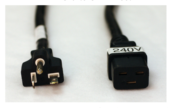
C19 to NEMA 6-20 4 foot (200-240VAC)