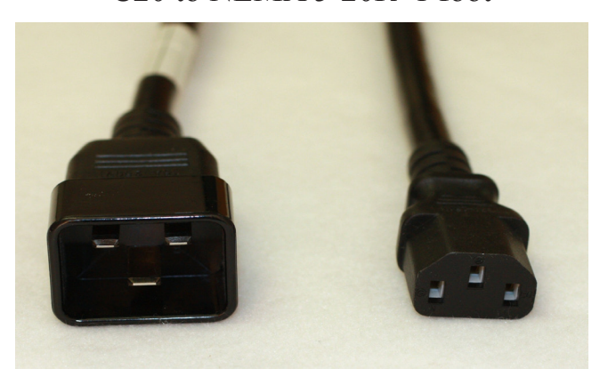
C20 to C13 1 foot