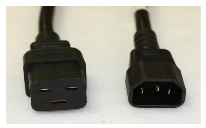
C19 to C14 1 foot