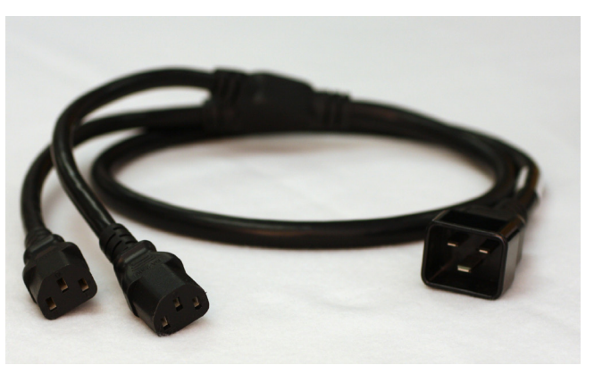
C20 to 2x-C13 4 foot (redundant power supply)