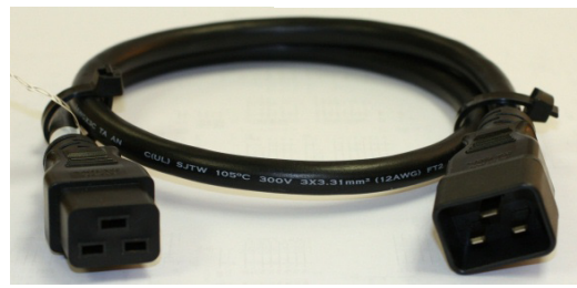
C19-C20 Cable included for output connection to device

Use the power cable provided with your equipment as power input