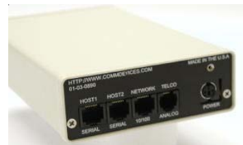
Port Authority SAM-22 (2 Port)